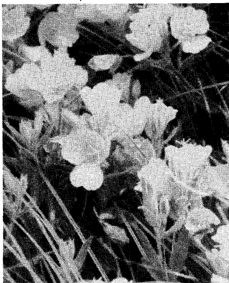
These Sundrops, captured on film 21 years ago have been growing in Markham for thousands of years. Your donations will ensure their presence for thousands more.

BE A $25 DONOR — RECEIVE AN ORIGINAL PHOTO ( it's a steal. . . )